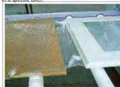
The device for separating the already wrapped goods during continuous wrapping. It allows to increase the wrapping capacity.

The operator may create several wrapping programs himself according to the requirement for packaging quality with a specific type of goods. Wrapping density, overlap and number of revolutions of the foil at the beginning and end of the wrapped goods can normally be changed in program parameters. The control system of a machine of the type PROFI allows for free editing of the program which makes possible creating of any wrapping without limitation by a fixed pattern of parametric programming (e.g. packing of goods only at several specific places etc.).